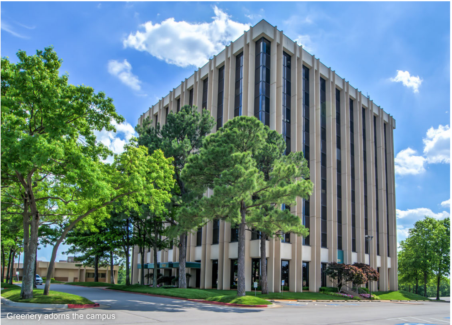
Greenery adorns the campus