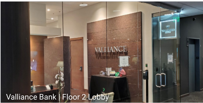
Valliance Bank | Floor 2 Lobby