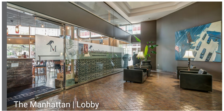
The Manhattan | Lobby